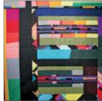
Hilary Gifford, fiber art

203 Pine Tree Rd, Ithaca 14850, 607-272-2613 Maryannbowman.com , StanBowman.com